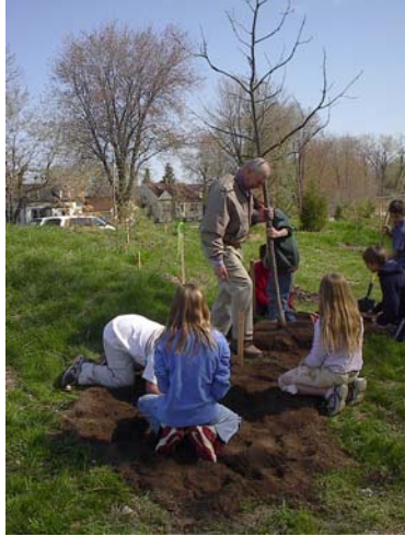
Arbor Day tree planting 4/24/2006

In May 2005, the last developable parcel of land adjacent to the Reserve was purchased, and a dream became reality. Thanks to the generosity of a single donor, the efforts of many in-kind contributors, and hundreds of volunteer hours, the process of transforming the parcel from a closed landfill to a prairie meadow and arboretum was established.