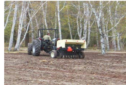
The prairie is planted 10/13/2006

You can help maintain and grow the Prairie Meadow and Arboretum project by sponsoring our efforts. Donations of $100 or more into the Prairie Meadow and Arboretum Sponsorship program will be acknowledged on a plaque in the Nature Center.